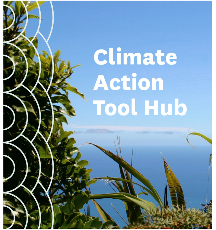
Climate Action Tool Hub