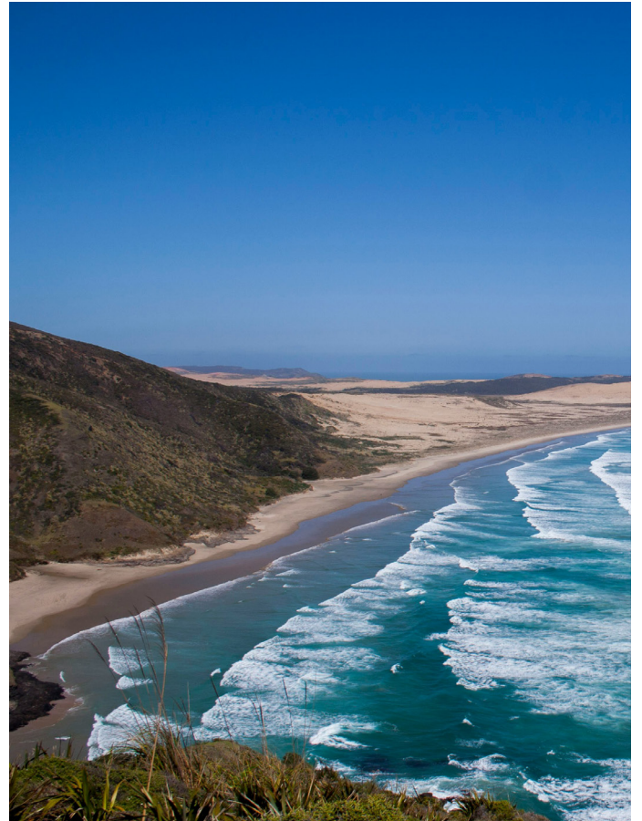
Te Tai Tokerau

Our investment portfolio continues to be managed against our Sustainable Investing policy. Foundation remains committed to viewing climate change as an urgent global issue, with both Management and the Board supporting actions to address this in our portfolio.