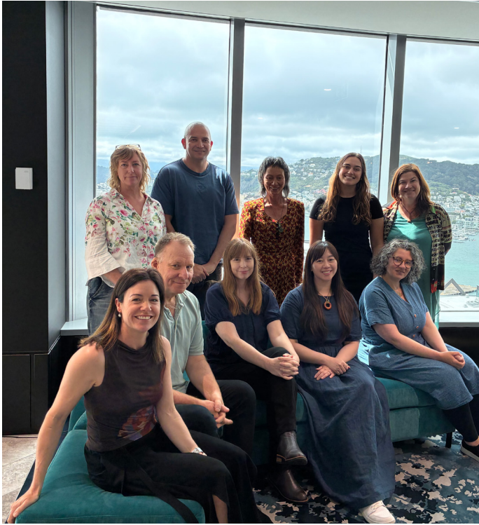
Climate Action Working Group strategic working day, facilitated by the Centre for Social Impact.